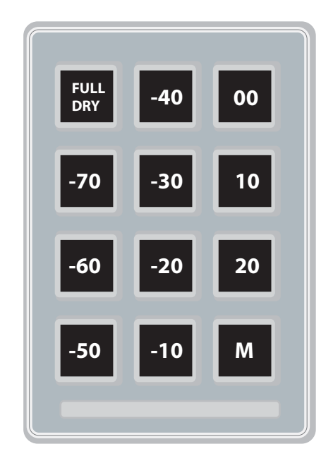
Figure 5 Front Panel Keypad

Any one of the pre-set dew points can be selected via the front panel keypad.